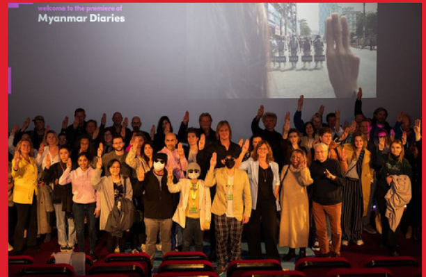
Platform members and audience pictured together raising the three finger salute in solidarity with Myanmar at the "Movies that Matter" Festival

At the end of the year most efforts of the platform were focussed on the organisation of the public commemoration of 2 years coup, held on 29 January 2023.