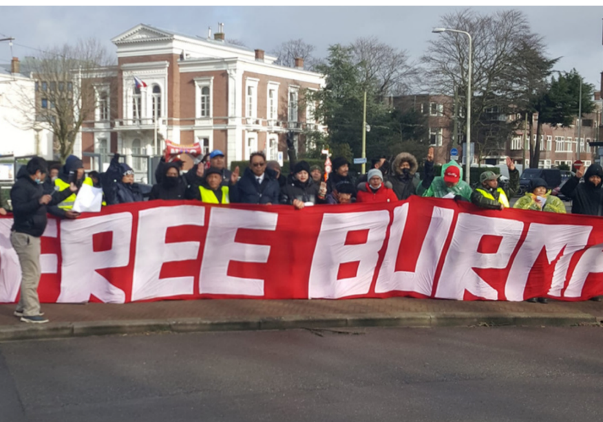
Platform members also took part in various demonstrations in support of Myanmar's democracy movement held during the year. Pictured on the left is a pro-democracy demonstration joined by our members outside the ICJ in February 2022.