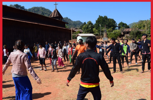
Karenni youths seen at the 'Youth Exchange Workshop'