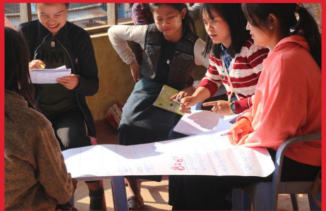
Young Karenni women participating at KNGY's 'Federalism & Democracy Awareness Training'

Some 14 internal meetings of the platform, in different composition and with different purposes, were held, mostly on-line. This included three formal meetings of the Foundation Board. Very special were the encounters with the NUG Minister for Human Rights, Aung Myo Min, and with the global Myanmar activists who came to The Hague.