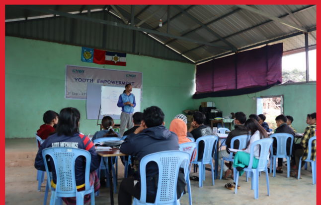
Participants attending KNGY's 5 day Political Awareness ToT training